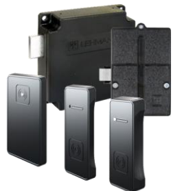
LEHMANN MIFARE® RFID systems